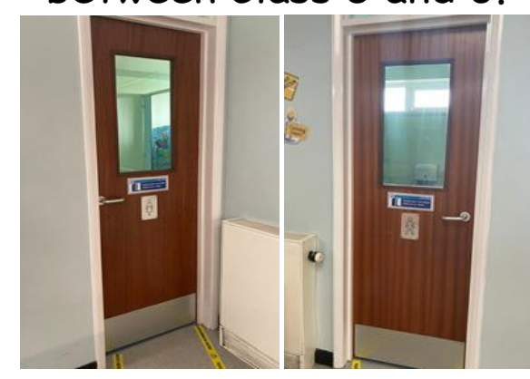
Class 5 & Class 6

Our new Year 2 toilets are between Class 5 and 6.